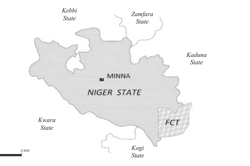
Fig. 1. Map of Nigeria's Niger State, showing Minna.

The study area for this work is Minna, the capital of Niger State, a semi-arid town in north-central Nigeria (Fig. 1). The city lies at latitude 90°36' 50"N and longitude 60°33'25". Minna has two local Governments: Chanchaga, which has its headquarters in Minna, and Bosso with head-quarters in Maikunkele, a peri-urban slum in Minna. The population of Minna as of 2012 was 613,246 [22]. The Chinchaga River is the major river in Minna, which drains into the Kaduna River at about 45 km on the northwestern